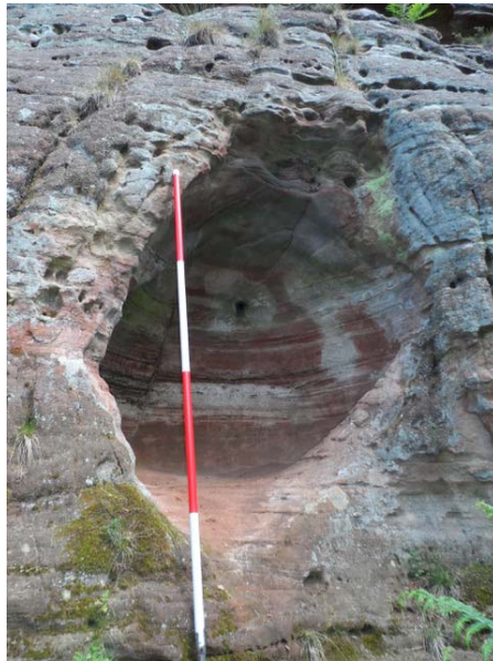
Gypsy’s Cave in Musket Hole